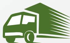
Logistics And Transport Companies