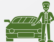
EV End Consumers