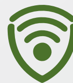
Telecom / Wireless Carriers