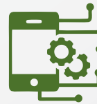
Mobility Service Providers