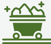
Battery Materials Mining Companies