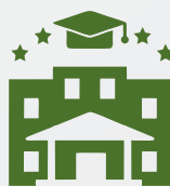
Academia And Institutions