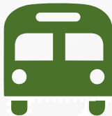
State Transport Departments